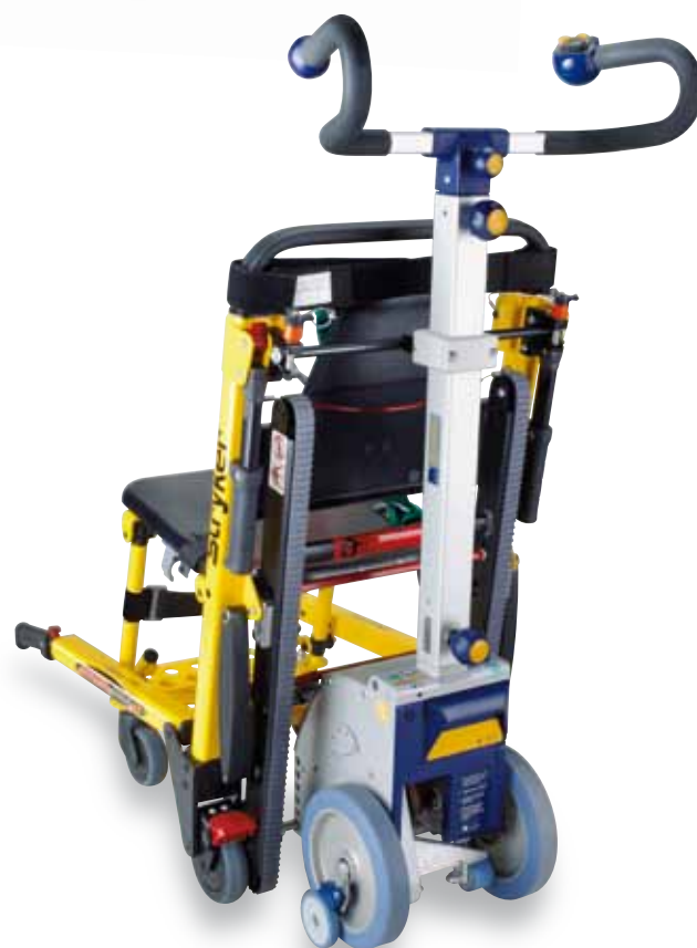
Stryker Stair-PRO 6252

Special installations provide a safe place inside the ambulance for each unit.