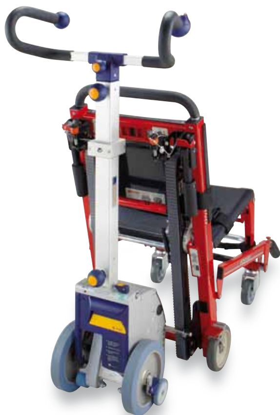
FERNO 59 T

Minimize your personnel’s absences from work and the thus resulting increased costs. The stair climber does not only relieve your staff but it also helps to keep costs from increasing.