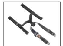
Seat belt system including hip belt