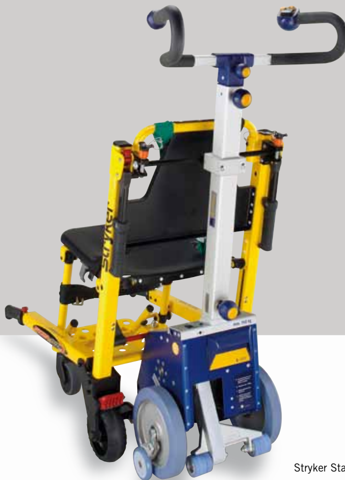
Stryker Stair-PRO 6251

The stair climber s-max can be attached (also retroactively) to a great number of chairs. Depending on the chair's frame and dimensions, either the s-max with a total load of 160 kg or 135 kg (always maximum total weight approved) is used.